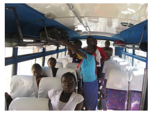
Some of the rescued children from Nairobi awaiting for transportation to MCF Ndalani

May the grace and peace of God be with you throughout this year as we continue to unite together in the service of the needy children and people of Africa.