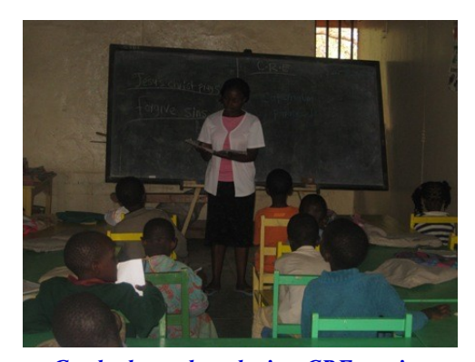
Grade three class during CRE session

It was with great joy when our children commenced the first term of the year on 4th January 2010. They are all working hard as they look forward to a productive year.